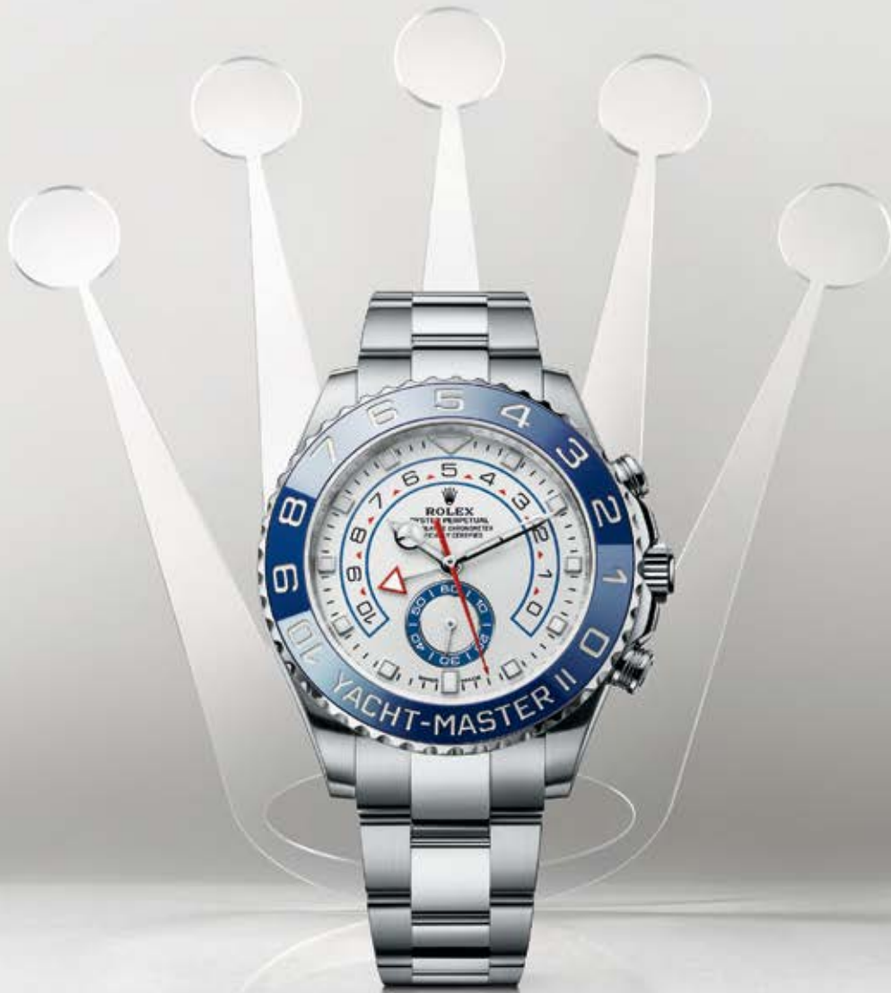
OYSTER PERPETUAL YACHT-MASTER II

The ultimate skippers' watch, steeped in yachting competition and performance, featuring an innovative regatta chronograph with a unique programmable countdown. It doesn't just tell time. It tells history.